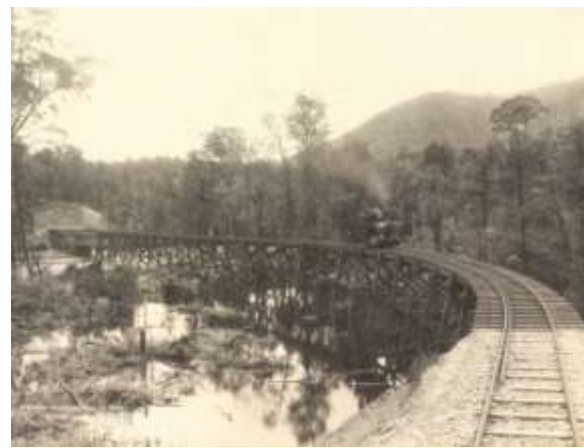
Figure 8 Quarter Mile Bridge c1896

In conjunction with the two sections, Teepookana to Dubbil Barril and Dubbil Barril to Lynchford, the Strahan firm of Gaffney and Harvey were building the final link between Lynchford and Queenstown. All earthworks and bridges were completed by 20 May 1896, ready for ballasting and track laying. The first train to steam into Queenstown on 18 July 1896 was hauled by a Hudswell Clarke locomotive, one of the locomotives purchased by the Company to assist the construction, and greeted by a large crowd of local residents.